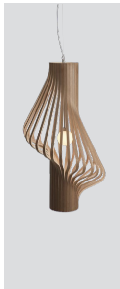
Diva pendant smoked oak – Item no. 382