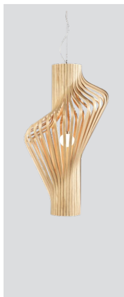
Diva pendant oak – Item no. 380