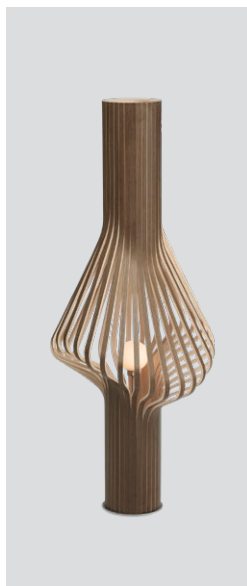
Diva floor smoked oak – Item no. 372