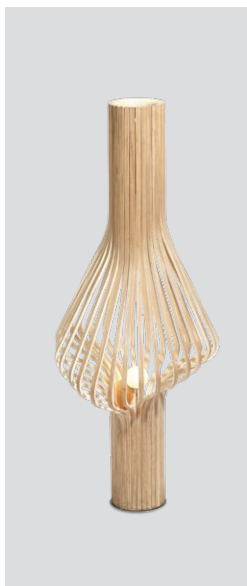
Diva floor oak – Item no. 370