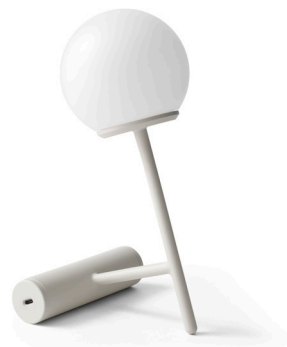
Light Grey 1755139