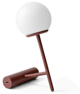
Burned Red 1755349