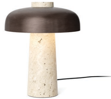
BRONZED BRASS 1410619Y

The Reverse Table Lamp is sold included five interchangeable plugs suitable for North America, Australia, China, Europe and the UK.