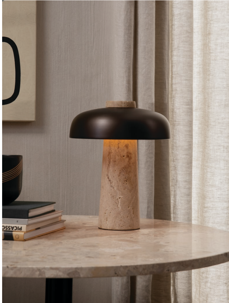
REVERSE TABLE LAMP Designed by Aleksandar Lazic