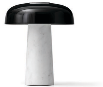
CARRARA MARBLE 1410639Y