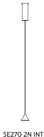
SE270 2N INT